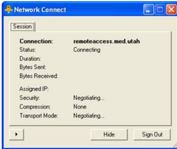
Small Connection Window