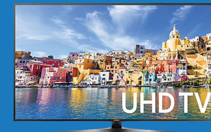
Samsung 55" 4K UHD TV