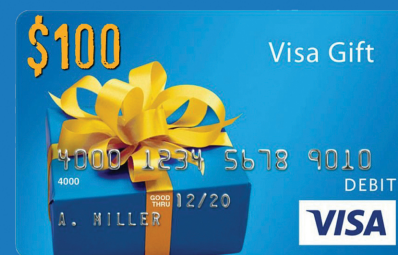
$100 Visa Gift Card

Additional opportunity to enter a random drawing for 1 of 3 prizes below.