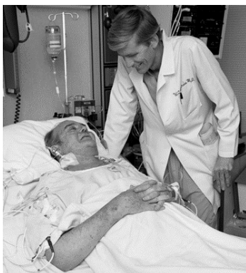
William DeVries, MD: Barney Clark's Surgeon Barney Clark: Recipient of the first total artificial heart