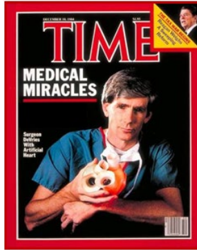
William DeVries, MD

renal insufficiency, idiopathic seizures and altered mental status, and fracture of a mitral valve strut, requiring replacement of the left prosthetic heart. However, by the end of the third month, pulmonary and renal function had stabilized, mental status was intact, appetite had improved, physical therapy was progressing, and plans for eventual discharge were envisioned. This stable state was interrupted on POD 92 by diarrhea and projectile vomiting with aspiration and pneumonia treated with respiratory support and antibiotics. On days 109-111, recurrent fever, hematochezia, progressive renal failure, and hemodynamic instability occurred, leading to circulatory shock and death on POD 112 despite intact function of the TAH system. Autopsy confirmed a diagnosis of pseudomembranous colitis, ATN, and chronic emphysema.