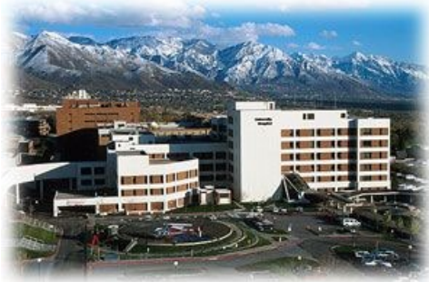
University of Utah Hospital

On the night of December 1-2, 1982, with a major winter storm howling outside, medical history was being made inside the University of Utah Hospital. This event was the implantation of the first destination total artificial heart (TAH) in a human being. That person, 61-year-old Barney Clark, was a retired Seattle dentist with family roots in Utah.